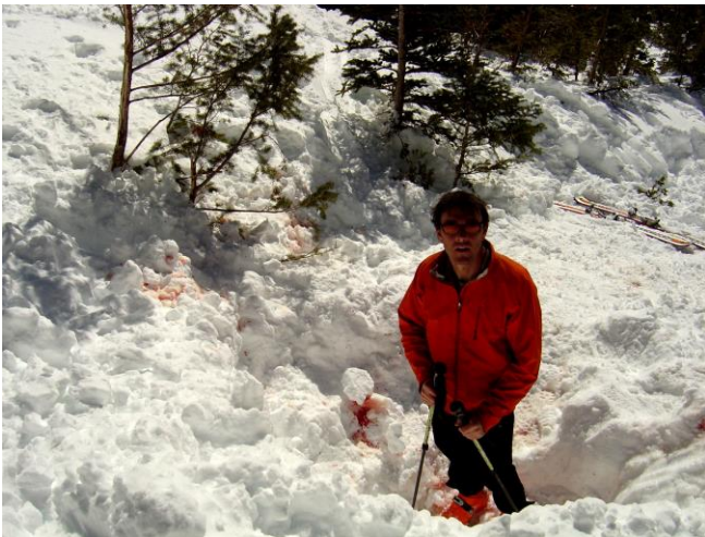
Victim was buried four feet deep near the toe of the debris. Cause of death was blunt force trauma.