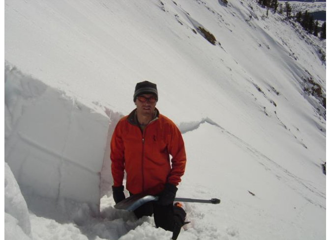
Crown line on Yellow Mountain. Fracture was 2 feet at deepest point and 75 feet wide. Avalanche released on a layer of small-grained facets that had been buried by a recently deposited wind slab.