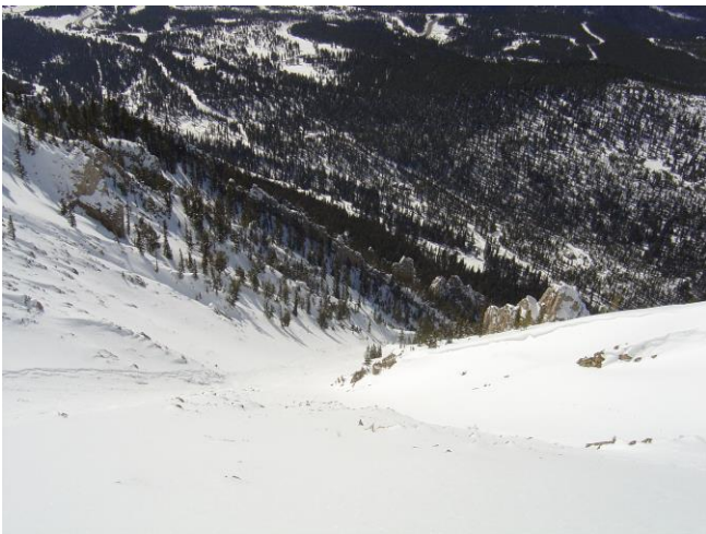
Looking down the avalanche path from the crown line. Path makes a sharp right-hand bend and descends over a cliff band near the rock outcropping that is seen center-right in photo.